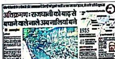
चार अप्रैल के अंक में हिन्दुस्तान में प्रकाशित खबर।

इस जमीन को अतिक्रमण मुक्त कराने से यहां लगभग 10 बीघा जमीन उपलब्ध हो गई है जिस पर डीडीए की ओर से गांववासियों के लिए पार्क बनाने की योजना है। इसके साथ ही यहां नाले को भी दोबारा बहाल किया जाएगा।