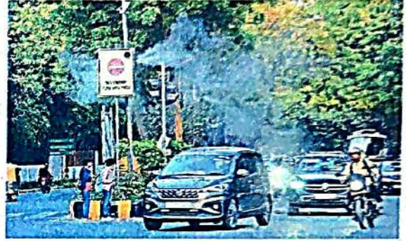
लोधी रोड स्थित खंभों पर प्रदूषण को कम करने के लिए लगाए गए फव्वारे

सड़कों के बीचोंबीच पर्याप्त संख्या में इलेक्ट्रिक पोल लगे हुए हैं। अब इन पोल पर मिस्ट स्प्रे सिस्टम स्थापित किया जाएगा। पर्यावरण विभाग की तरफ से यह आदेश पीडब्ल्यूडी, एमसीडी, डीडीए और एनडीएमसी को दिए गए हैं। इसमें सड़कों के सेंट्रल वर्ज पर लगे सभी इलेक्ट्रिक व दूसरे पोल पर मिस्ट स्प्रे सिस्टम या इस जैसे दूसरे सिस्टम लगाने को कहा गया है। सबसे पहले