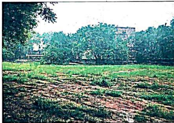
The land in Pocket 1, Block B of Vasant Kunj. 85% of the land lies within the protected morphological ridge.