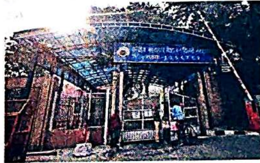
Tihar is close to Tilak Nagar and Hari Nagar.

On the current capacity of Tihar, the official had said jails 1