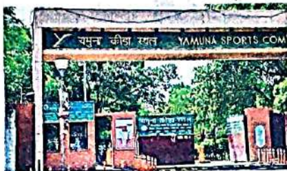
सूरजमल विहार स्थित यमुना स्पोर्ट्स कॉम्प्लेक्स

एक आधिकारिक बयान में, डीडीए ने कहा कि हर साल अनुमति का नवीनीकरण आवश्यक