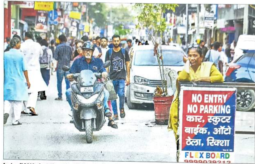
In April 2019, the 1.7km Ajmal Khan road was declared a motorised vehicle-free zone but vehicles still enter the stretch. (Below) The road went for redevelopment in May 2019.

Devinder Kohli, a trader in the market, said the project was bound to fail. "It is very difficult to