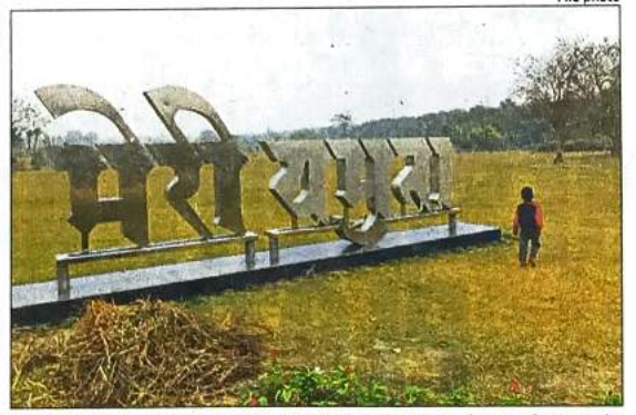
UNDER REVAMP: Under the Asita West project, DDA is carrying out the revival of the floodplain through forests and grasslands and through the creation of waterbodies and catchment zones

"We are of the view that on principle, there can be no objection to the proposal if it's approved by the HLC and is meant for protection of the floodplain zone and is within the purview of permissible activity in terms of para 80 of the order of this tribunal dated January 13, 2015 and the River Ganga (Rejuvenation, Protection and Management) Authorities Order, 2016," said the