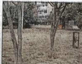
सफाई होने के बाद यहां आने वाले लोगों को मिली राहत