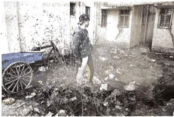
Ghost town: Heaps of garbage have taken over the DDA housing society in Narela with mostly uninhabited flats.

In 2008, the Delhi Development Authority (DDA) selected Kathputli Colony, home to street performers and artisans, for an in-situ slum rehabilitation project executed on a public-private partnership (PPP) model by Raheja Developers. In line with the policy for