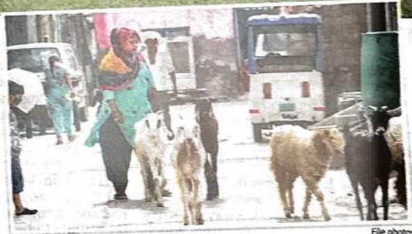
Projects approved by development board

Work of over ₹1,500 crore approved by development board since 2018