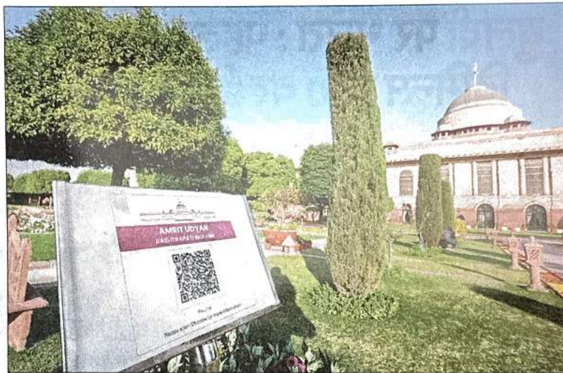
कागजों या साइनेज पर नाम बदल देने के बाद भी आम लोग नए नामों के साथ नहीं बना पाते हैं अपना जुड़ाव

दिल्ली में फ्लाईओवरों के भी नाम बदले गए हैं। मसलन, 2016 में दिल्ली सरकार ने बारापूला एलिफेंट रोड का नाम बदलकर बाबा बंदा सिंह बहादुर सेतु रखा, तो वहीं लाजपत नगर फ्लाईओवर का नाम झुलेलाल सेतु