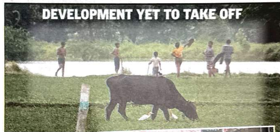
DEVELOPMENT YET TO TAKE OFF

"Between 2018 and 2021, DVDB approved development projects of Rs 1,258 crore but work didn't start even on one of them. The work on 86 smaller projects of Rs 30 crore was started during this period but even that was left midway. In the last two financial years, projects worth Rs 265 crore were announced. The Delhi government had announced spending Rs 2 crore