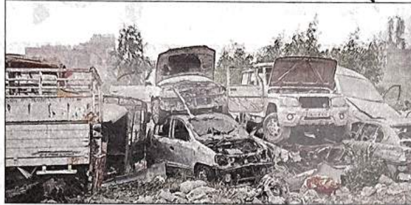
इस जगह की देखभाल नहीं होने की वजह से बढ़ी दिक्कत