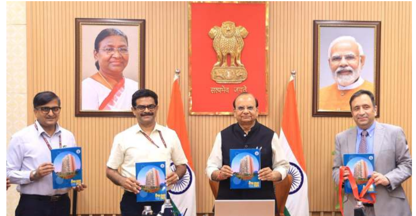
Hon'ble Lt Governor of Delhi launches DDA's 'Apna Ghar Awaas Yojana 2025'