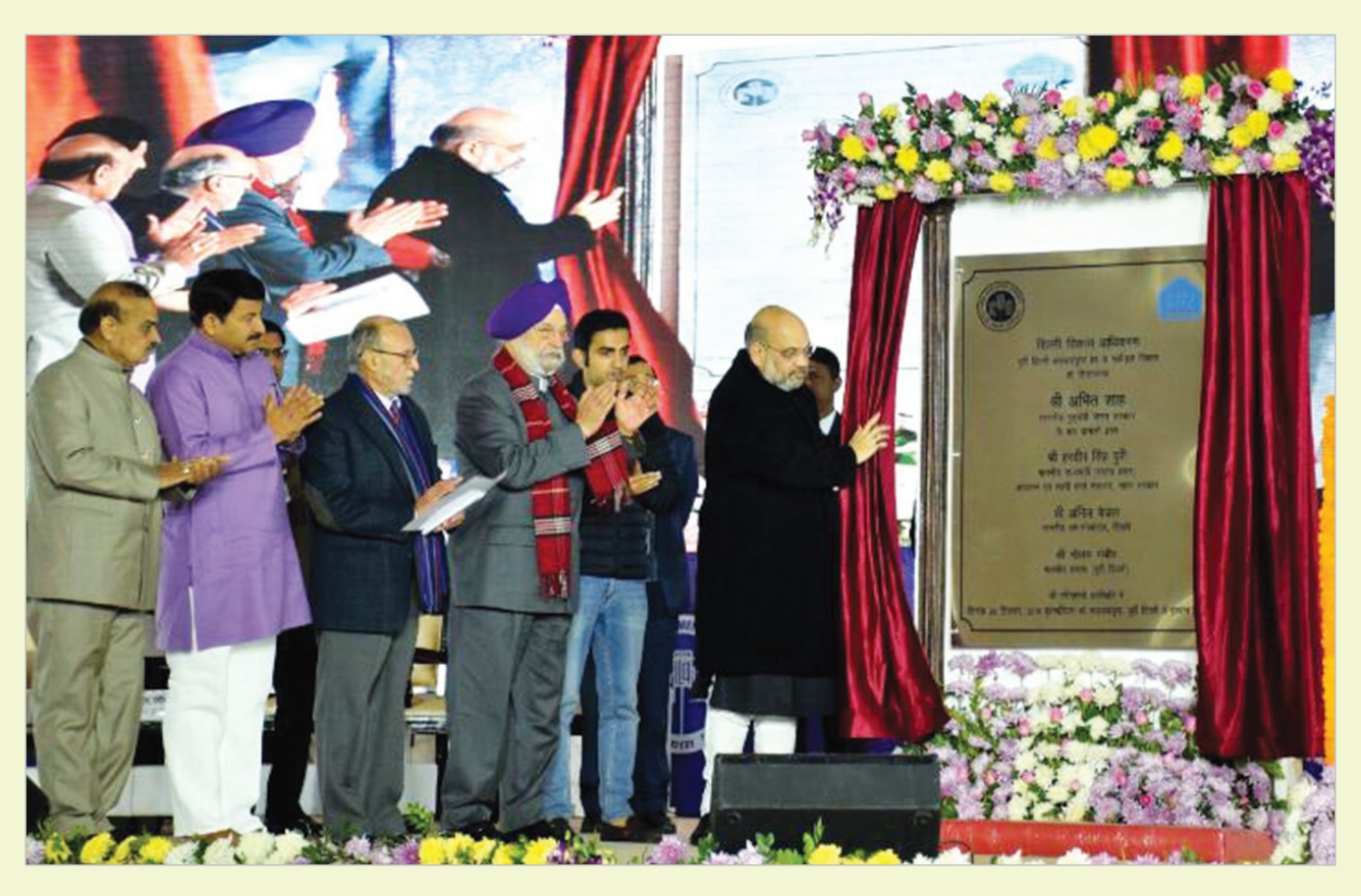
Inauguration of DDA's developmental projects in East Delhi by Shri Amit Shah, Hon'ble Home Minister, Government of India