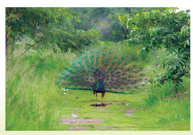
Dancing Peacock at Yamuna Biodiversity Park

Delhi, spread over an area of 1497 sq. km, is one of the greenest metros in the country. The city has experienced tremendous growth in recent times, with increased pressure on its open spaces. Delhi Development Authority (DDA), the first Urban Development Authority in India, has played a key role in overall development and management of its green spaces, with conscious efforts towards the development of open spaces as Regional parks, Biodiversity Parks, District parks, green belts, Neighborhood greens, etc. Currently, DDA has more than 783 parks, 7 Biodiversity Parks and some forests areas. DDA has categorized parks into a, b and c categories. The category 'a' parks are comparable with the best in the world.