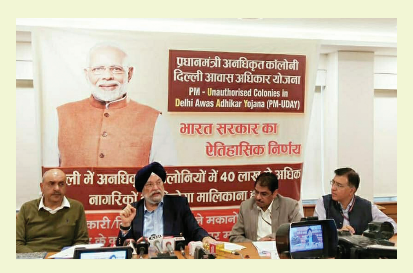
Press Conference on PM-Uday Scheme by Shri Hardeep S Puri, Hon'ble Minister of State (I/C) Ministry of Housing and Urban Affairs.