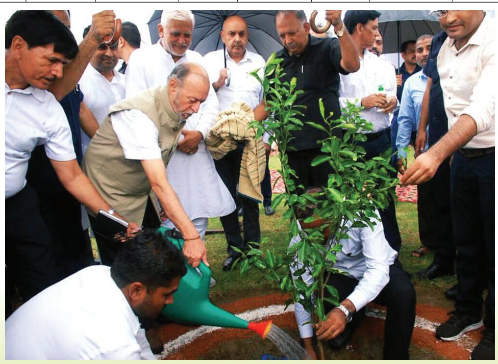
Plantation drive by Shri Anil Baijal, Hon'ble Lt. Governor Delhi