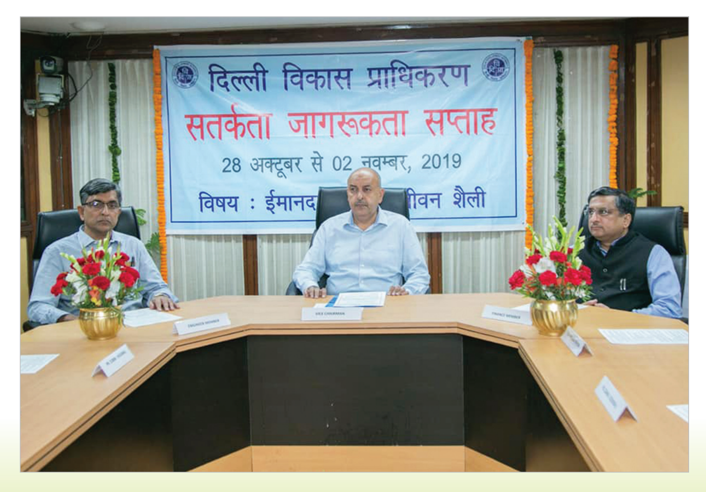
Vigilance Awareness Week

Pledge was administered to all the DDA officers and staff on the opening day of the vigilance week by VC, DDA. The Vigilance Awareness week-2019 was celebrated with the aim to sensitize DDA officials regarding importance of integrity in public service system and simultaneously encouraging public participation. During the vigilance week, more than 6521 nos. pledges were administered to citizens/organization/public visiting DDA/NSKs for their work. The celebration was publicized through DDA's websites and by means of banners/posters/stickers/pamphlets. competition/poster making/slogan writing/ debates were also conducted. The Vigilance Awareness Week was concluded with a grand function in the graceful presence of Sh. Tarun Kapoor, Vice Chairman, DDA on 01.11.2019.