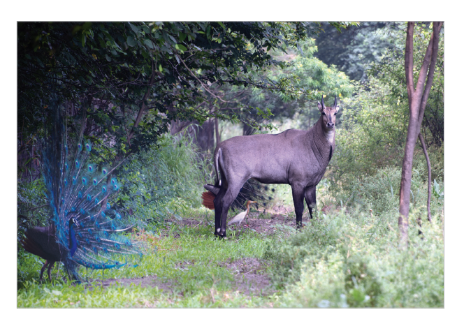
Nilgai at Aravalli Biodiversity Park