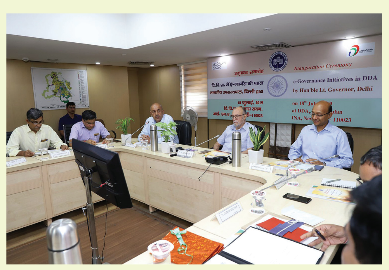
Launching of various e governance initiatives by Shri Anil Baijal, Hon'ble Lt. Governor Delhi