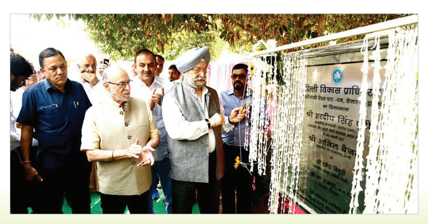
Shri Hardeep S Puri, Hon'ble Minister of State (I/C) Ministry of Housing and Urban Affairs and Shri Anil Baijal, Hon'ble Lt. Governor Delhi lay foundation of various projects of DDA at Dwarka