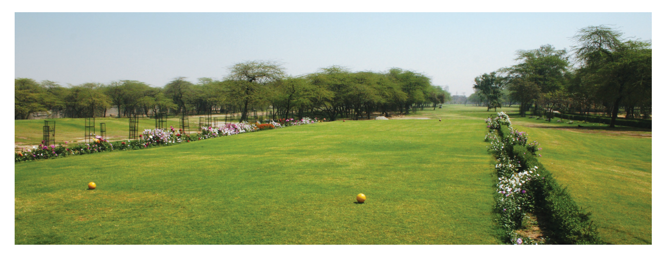
Bhalswa Golf Course

Maintenance and upkeep is an ongoing process at all complexes to ensure that the facilities are kept in good shape. In addition, major up-gradation works of capital nature were also carried out at all the sports complexes and golf Courses.