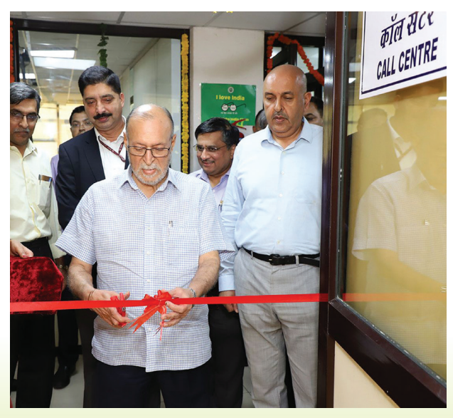
Inauguration of DDA Computerised Call Centre by Shri Anil Baijal, Hon'ble Lt. Governor Delhi.