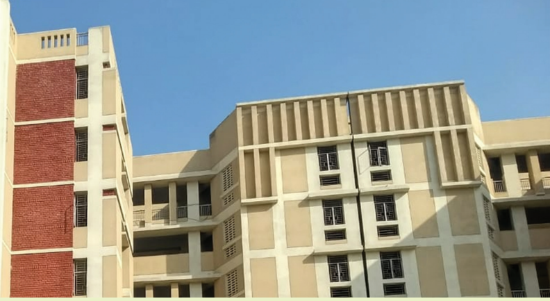
DDA Flats at Vasant Kunj