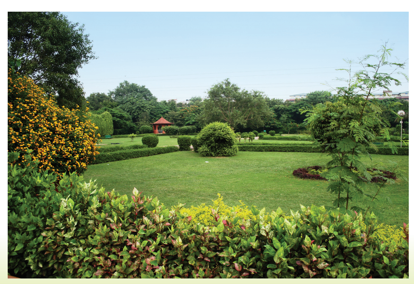
Chitragupt Park, Rohini

The cumulative efforts of DDA's initiatives and achievements have visibly transformed the city into a dynamic, vibrant, global metropolitan city that's seamlessly changing, adapting, growing and glowing as the pride of India. Aligning itself with the changing times, DDA has also become an undisputed leader in the development of sports facilities and in promoting greenery in the process, touching and transforming life in every conceivable manner.