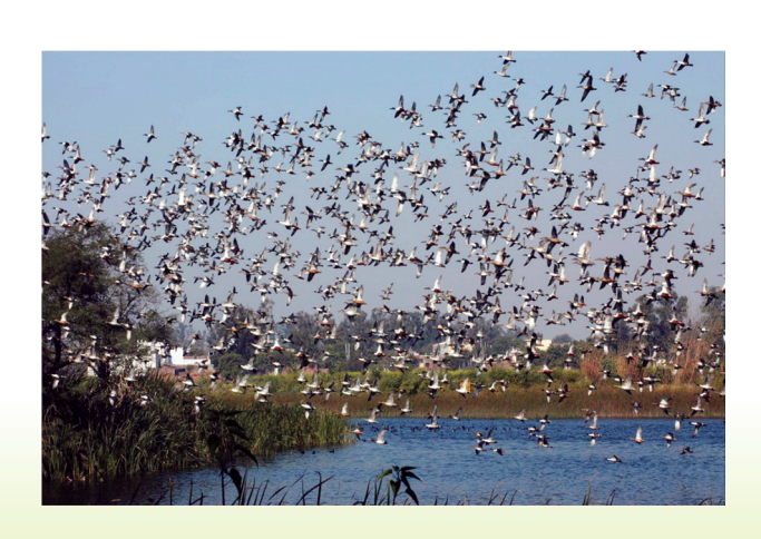
Migratory Birds at Yamuna Biodiversity Park