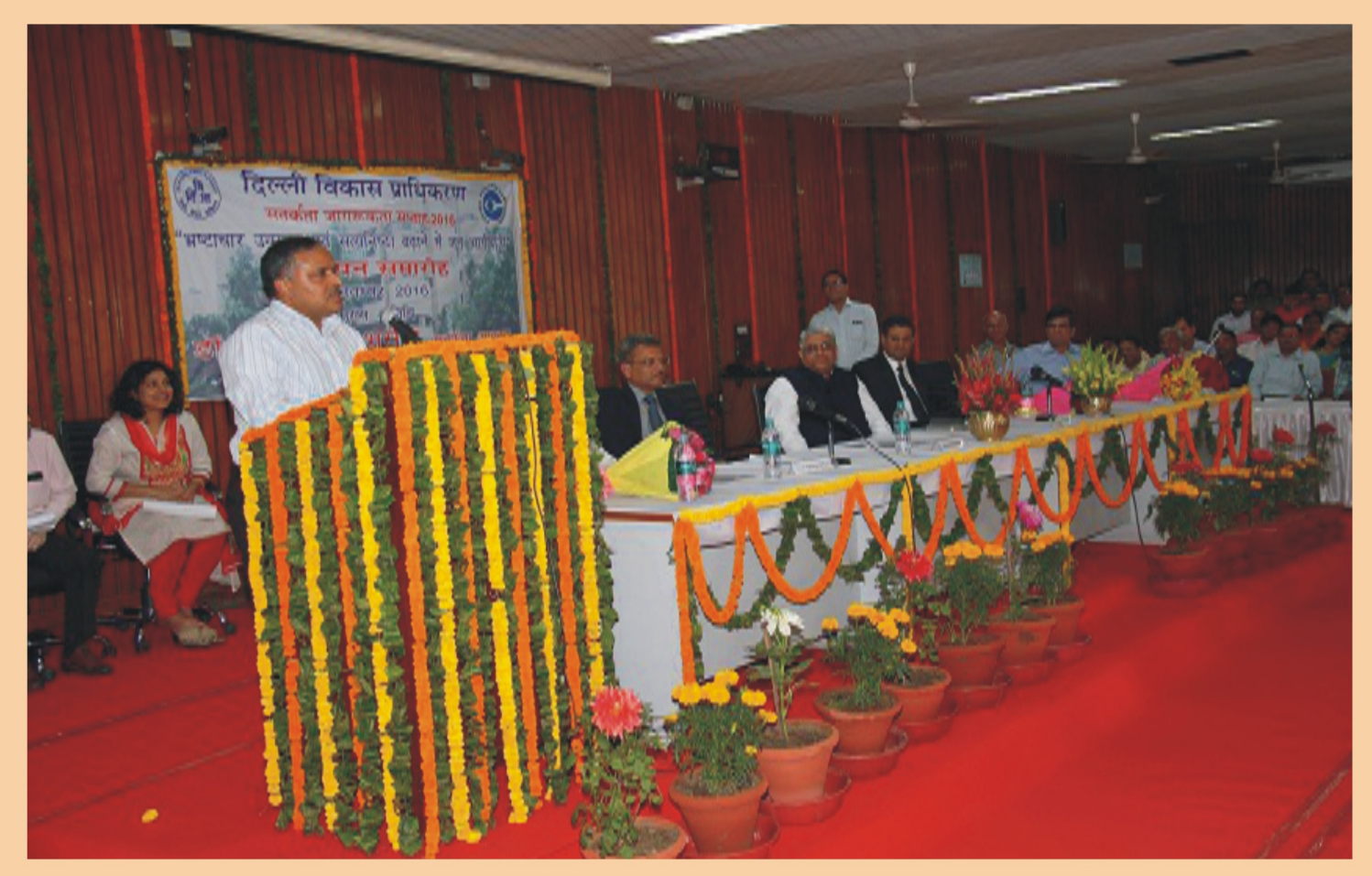
Vigilance Awareness Week