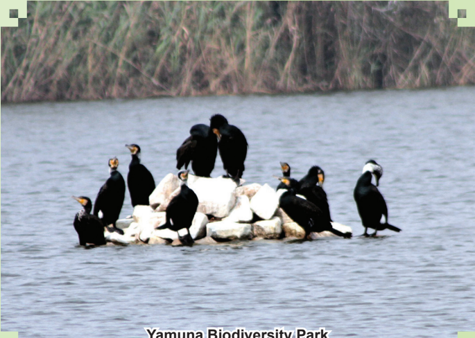
Yamuna Biodiversity Park

On-line issue of No Dues Certificate. 1.